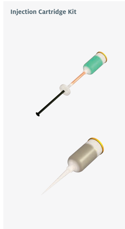
Injection Cartridge Kit