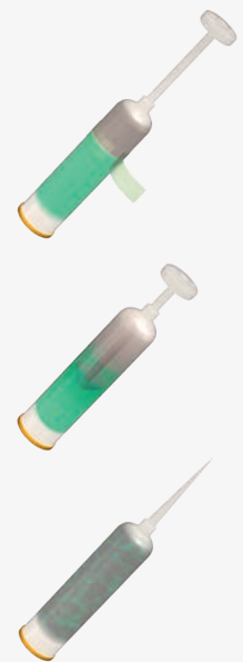
Barrier Cartridge Kit